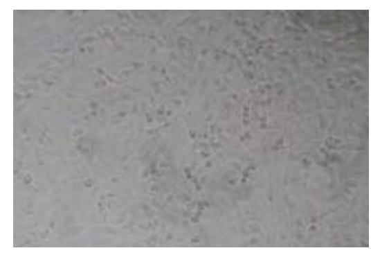
Cells not infected by the virus